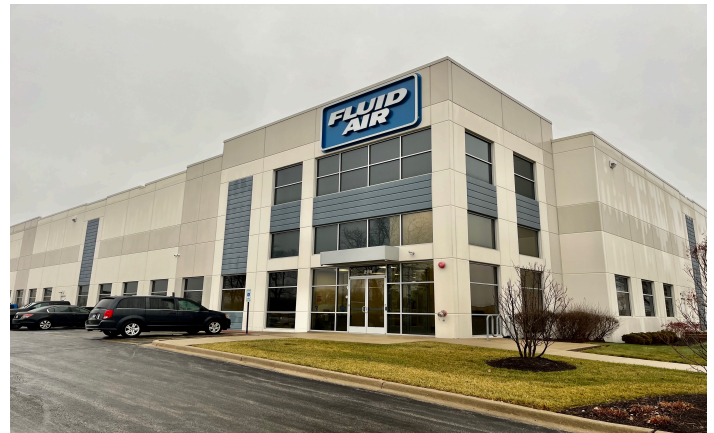
Fluid Air HQ, Naperville, IL

Once the secure connection is established, our engineers are able to work, from anywhere, directly on the machine(s) installed at your facility via the integrated on-demand router that links your system to your computer network/intranet. Each intervention is agreed to in advance, and data transfer is 100% secure.